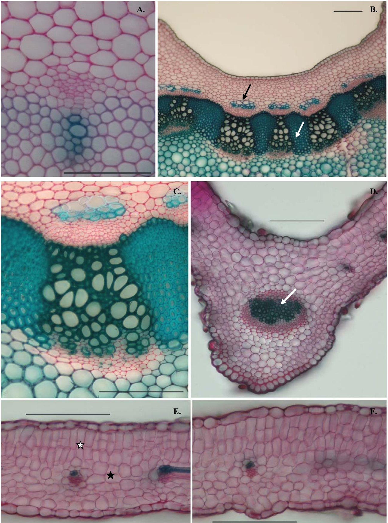
Figure 2. Micrographs of the cross sections through stem and leaves of Erysimum wittmanii : A - cross section through the top of the stem with primary structure – detail from a small vascular bundle; B – cross section through the stem basis with the secondary structure (black arrow indicate the sclerenchyma at the phloem pole; white arrow indicate the lignified secondary rays) ; C - cross section through the stem basis – detail from a vascular bundle; D – cross section through a leaf from the upper part of the stem – detail from midvein (white arrow indicate the unique vascular bundle); E – cross section through a leaf from the upper part of the stem (white star – palisade parenchyma, black star – spongy parenchyma); F – cross section through a leaf from the middle part of the stem (scale bar – 100 μm) (original).